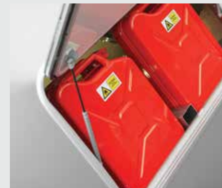
Front Wall Access Hatch The front wall access hatch allows for easy access to the front storage cabinet.