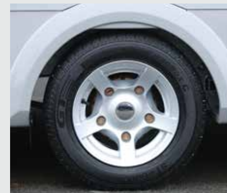
Alloy Wheels Give your trailer the wow factor by adding a set of exclusive alloy wheels.