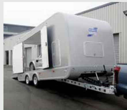
Tilting Drawbar To aid loading vehicles with low ground clearance.