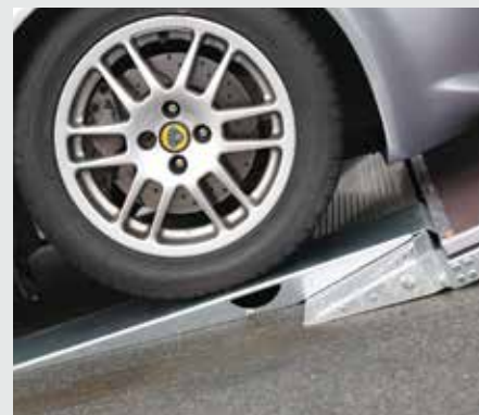
Ramp Skid Extenders Pair of ramp skid extenders to aid loading of vehicles with low clearance.